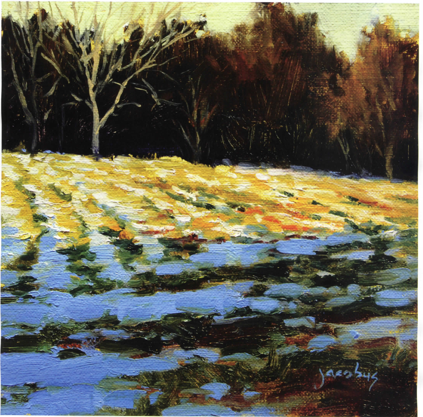
■ ..... Melting Snow , 2011, oil on linen, 6" x 6"