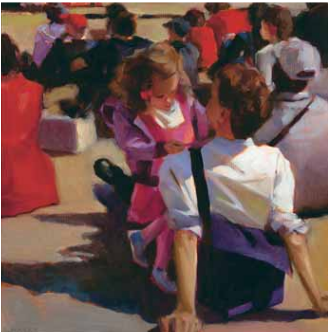
Paying Attention, oil on canvas, 20 x 20"