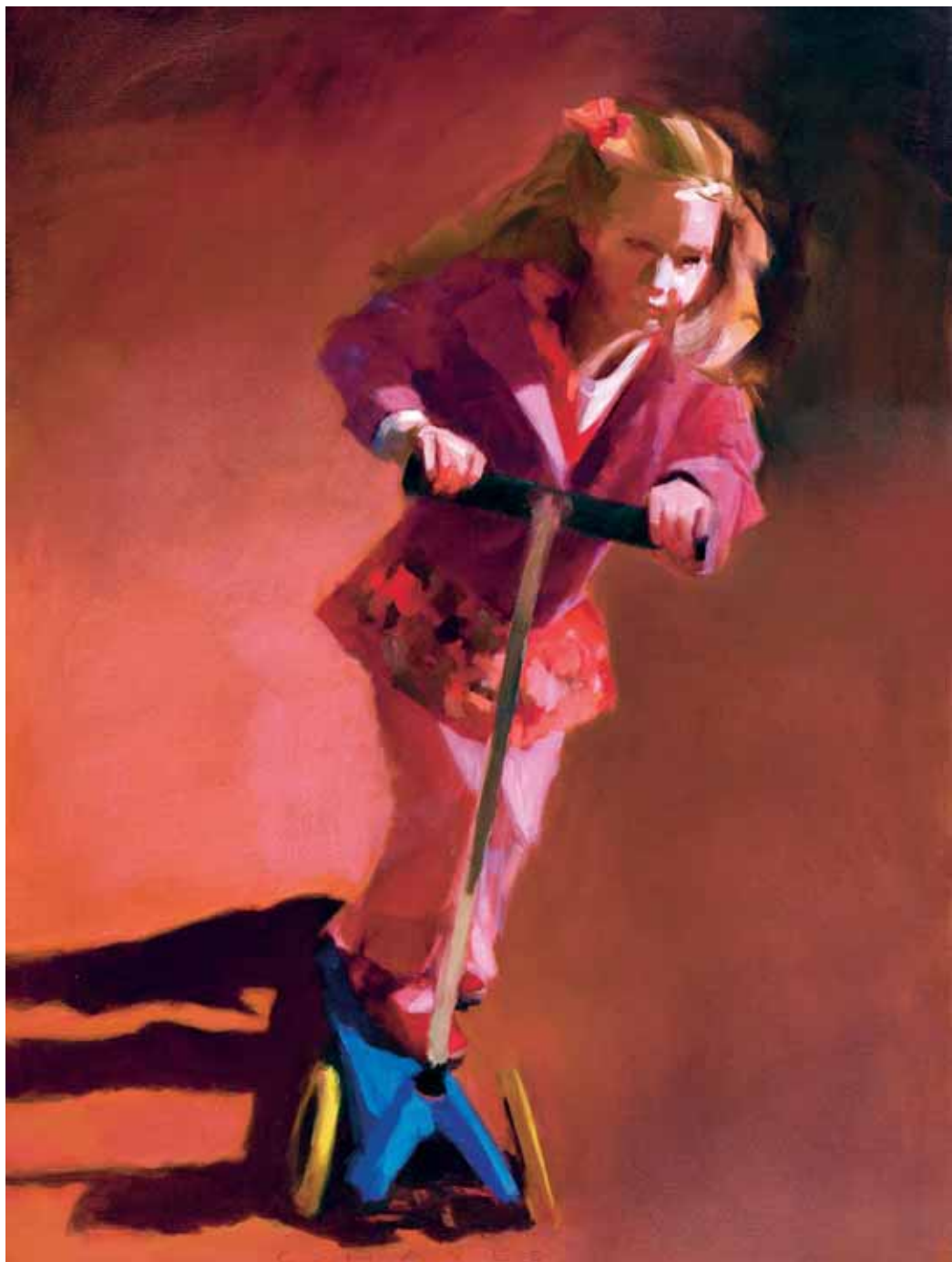
Blue Scooter, oil on canvas, 40 x 30"