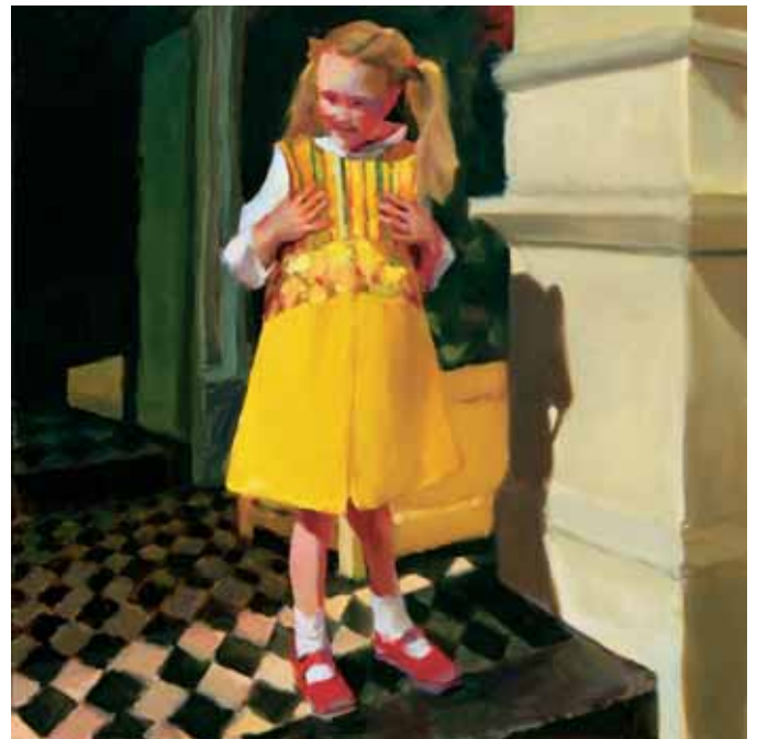
I'm Ready, oil on canvas, 36 x 36"