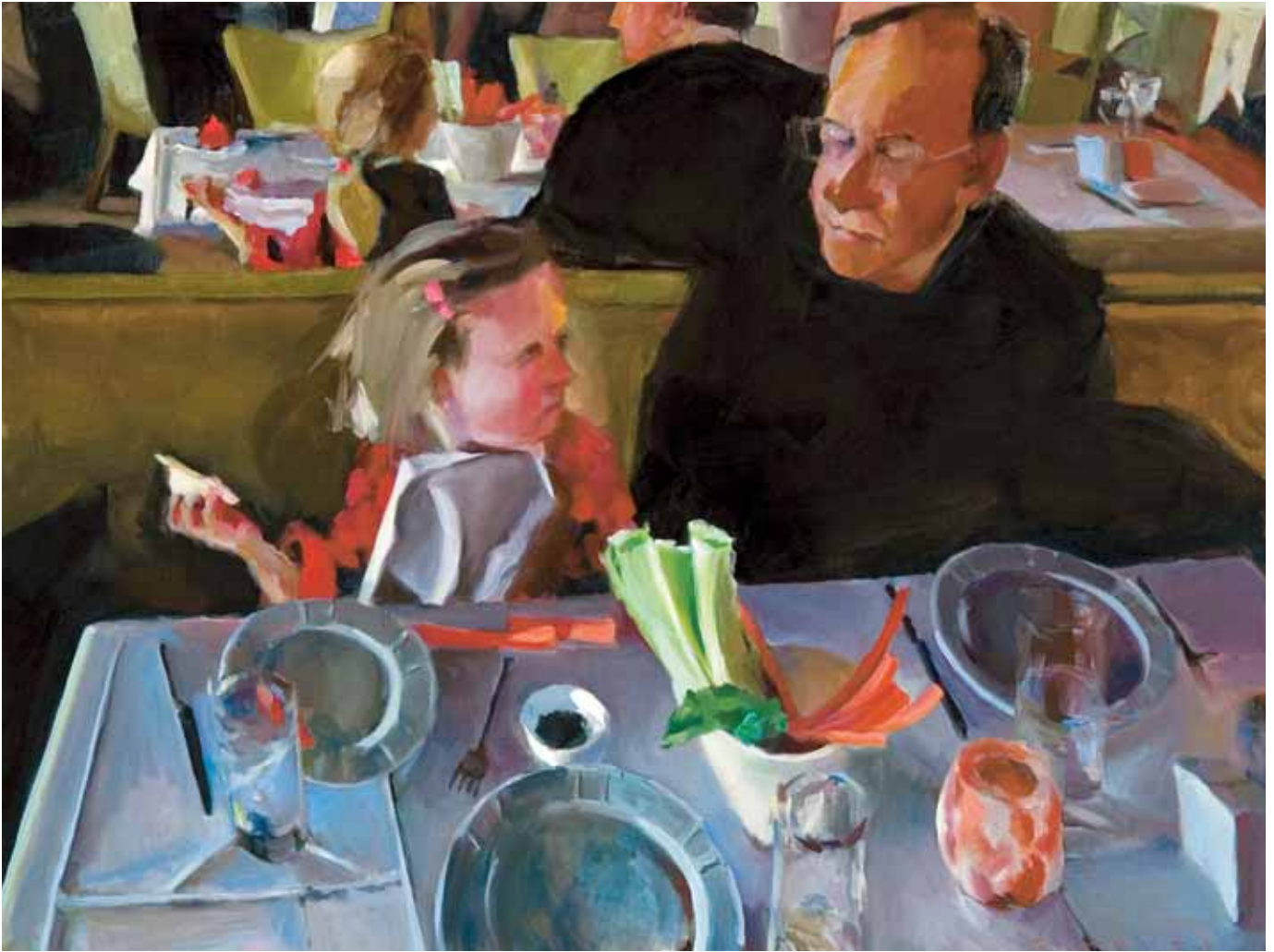
Going Out, oil on canvas, 30 x 40"